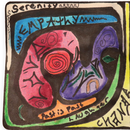
Artwork from behavioral health patients in the Holter Healing Arts Program.

one counseling and is now embedded into clinic primary care teams to offer real-time care during routine visits if needed. When in-office visits were scaled back due to COVID-19, the team launched targeted outreach efforts to check in on patients and employees by phone or using telehealth options.